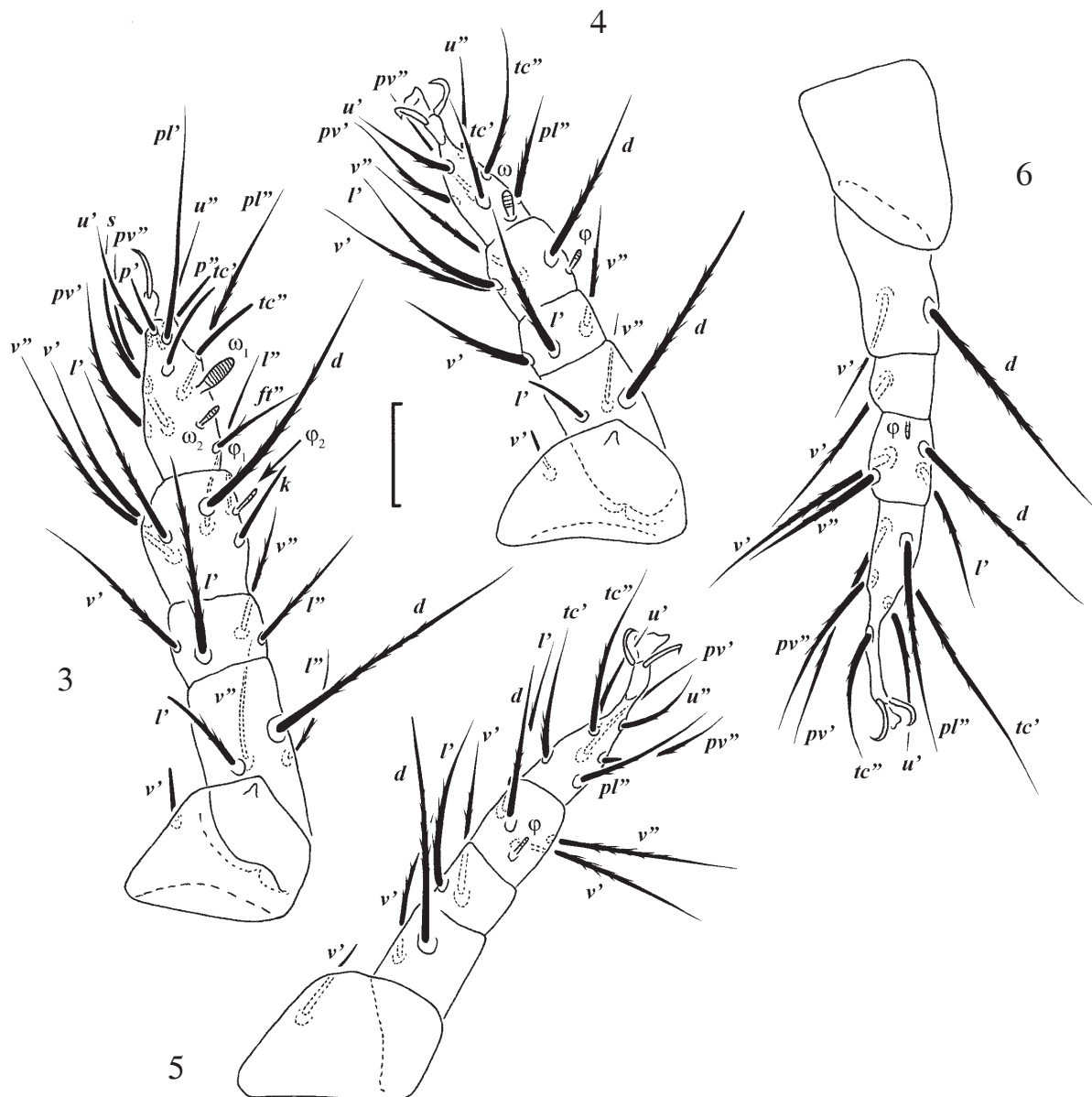
mata. Memoirs of Entomological Society of Canada , 136: 1–517.

Mahunka, 1970 (Acari, Tarsonemina)]. In : “Pests and diseases of fruit, subtropical and ornamental plants” collected scientific works, 99: 7–30. [In Russian]